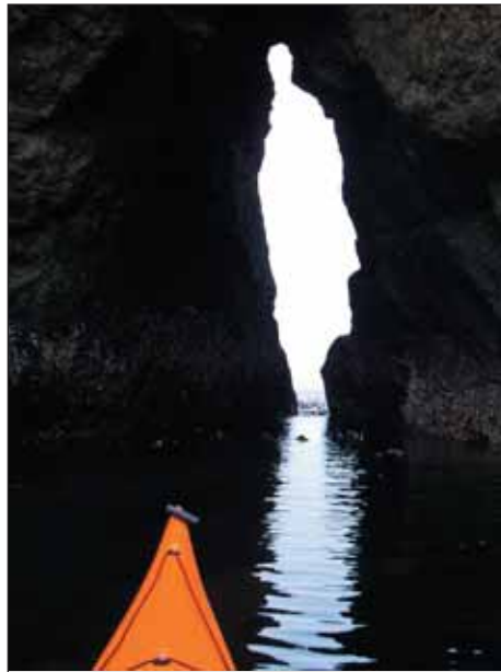
Just one of many sea caves.

The headlands formation has created such an amazing sea and land interface that it's nearly overwhelming. Caves, arches, tunnels, slots and gardens in abundance. And that was just on the surface. The water was so clear that